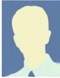
CIPS Prince Edward Island Vacant