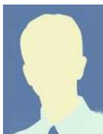
CIPS Alberta Vacant