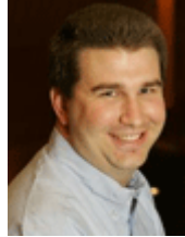
S. W. Ontario Barnaby Jeans