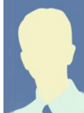
Toronto Vacant **