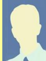
CIPS New Brunswick Vacant