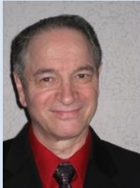
Ontario Leon Wagschal I.S.P., ITCP