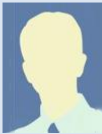
Newfoundland and Labrador/Nunavut Vacant