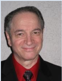
Ontario Leon Wagschal I.S.P., ITCP