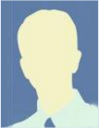
British Columbia & Yukon Territories Vacant