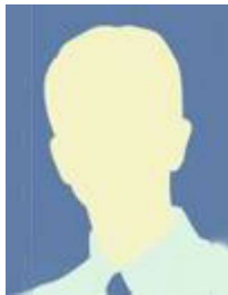
CIPS Newfoundland & Labrador Vacant