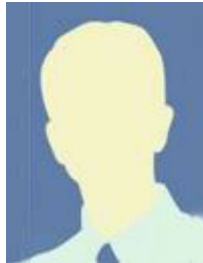
CIPS Alberta Vacant