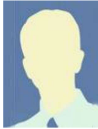
CIPS Prince Edward Island Vacant